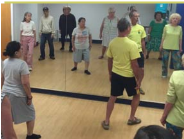
Tai Chi Class