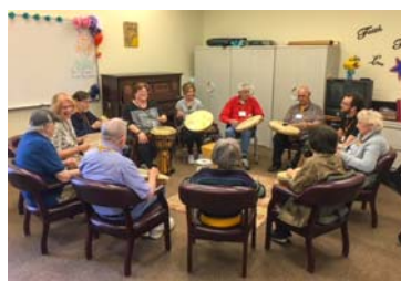
Adult Day Services Drum Circle

The Social Services Department also includes the Caring Hearts Adult Day Services Program, which engages older adults with mild to moderate memory loss in structured activities, provides opportunities for socialization, exercise and lunch, and gives those caring for them a break. The program is offered Mondays through Thursdays.