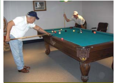
Enjoying a game of billiards

Clients may receive more than one service. Services will not total 2,994