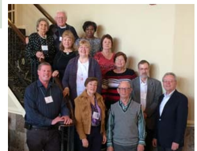
2017 Award Recipients at Recognition Event