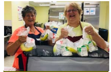
Preparing meals for delivery

back about the service, one home delivered meals recipient wrote: "Thank you, thank you for the fantastic job you all do in providing good meals for us, for your caring ways, and for being so willing to accommodate our wishes. I'm most appreciative."