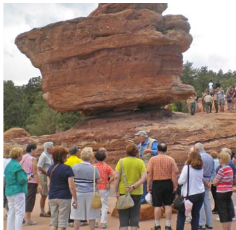
Trip to Garden of the Gods, Colorado

Coming to the Senior Center is good for you! The Senior Center is a great place to meet with friends - or make new ones! There are many ways to have fun at the Palatine Township Senior Center. Whether you're interested in parties, games, travel, lifelong learning, health and wellness, meals, or information about benefits or services, PTSCC has something for everyone.