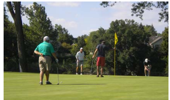
PTSCC Golf League

Our Vision: We envision a caring and healthy community which recognizes the wisdom and experiences of older adults, and demonstrates awareness and respect for the aging process.